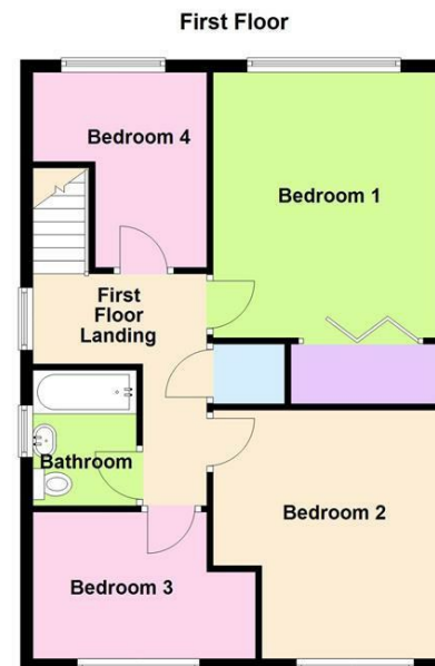
12 Teal Road, Newport